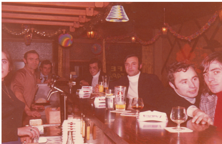
During the 1970s, the Las Tapas bar was frequently visited by Spaniards, Algerians, Tunisians, Moroccans and Italians. It was also a favourite hangout of Spanish language students.