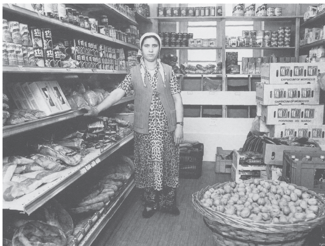
A woman is seen posing in a retail shop in Ghent, in the late 1970s. Amongst the products on display we can distinguish paprikas from Morocco on the right. At that time, this vegetable was still fairly unknown among the Belgian population.