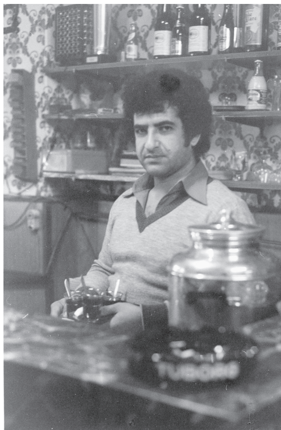
A Turkish bar owner in Ghent, in the early 1980s.