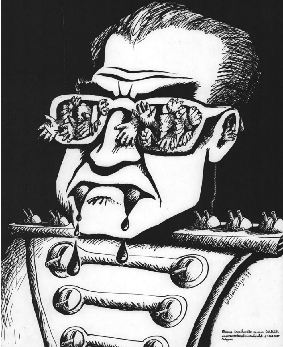
Poster caricaturing Shah Mohammad Reza Pahlavi, drawn by Willy Wolsztajn for the VIK, with the cooperation of the ODYSI in 1977.