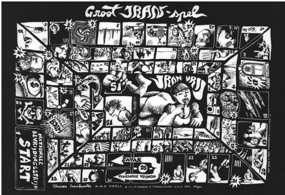
Poster representing the 'Fight for the National Liberation of Iran' as a board game, drawn by Willy Wolsztajn for the VIK, with the cooperation of the ODYSI in 1977.