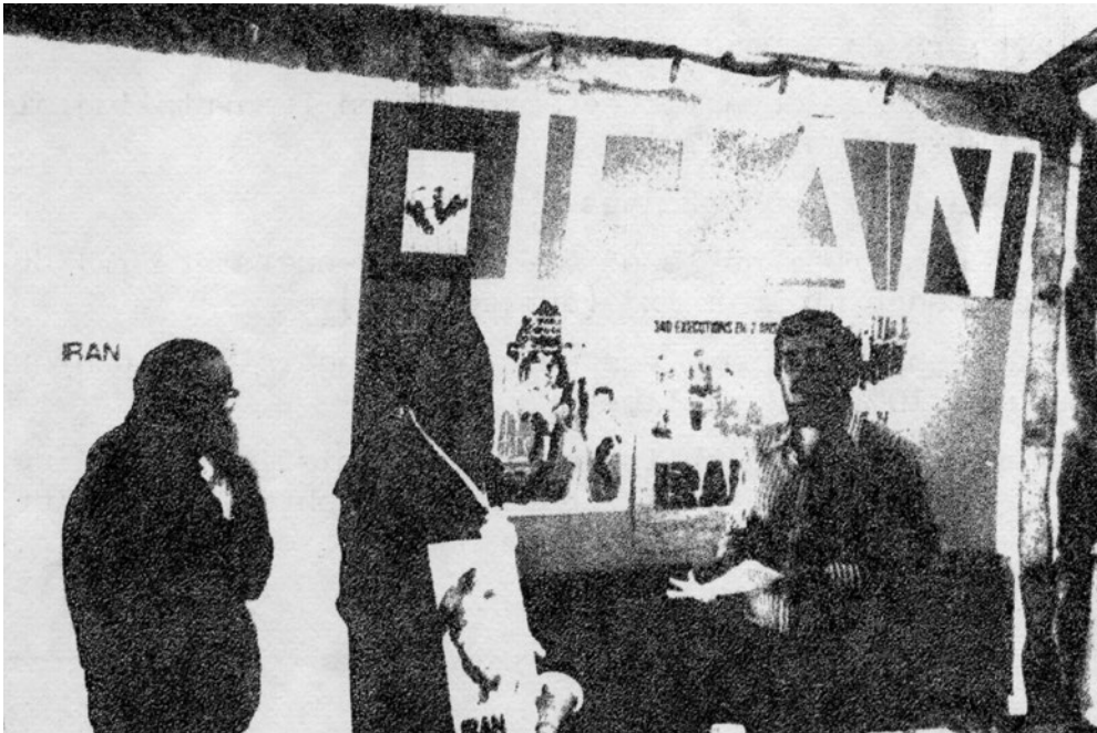
Picture of the CSI at the 12-13 November 1977 Peoples' Festival.