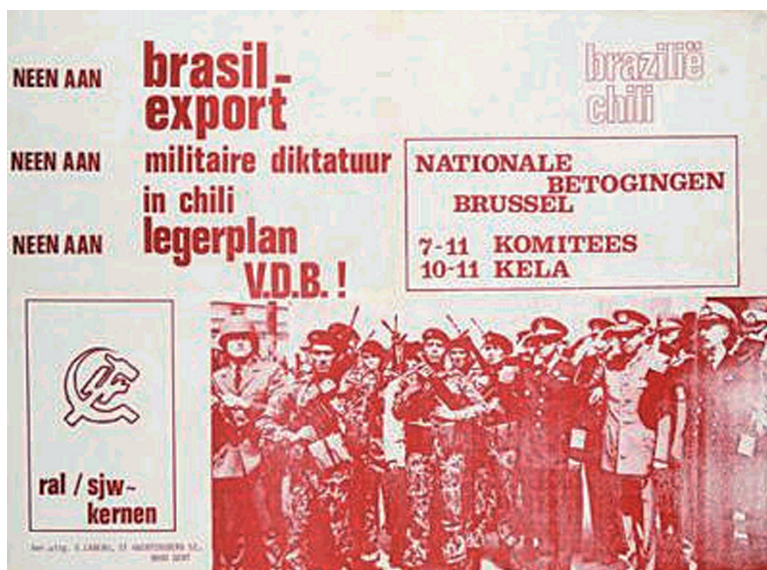
International causes turned into domestic issues. Poster for demonstrations which welded protest against the trade fair Brasil Export to denunciations of the 1973 coup in Chile and protest against the army reform plans of the Belgian government in November 1973.