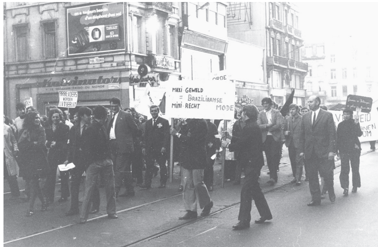
The protest demonstration of October 1970 united an intergenerational and pluralistic array of militants, including clerics, academics, students, and politicians, behind protest against the repression in Brazil.