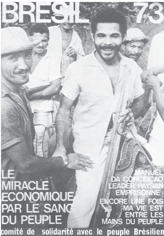
Cover of a 1973 booklet published by the Committee of Solidarity with the Brazilian People in Geneva and denouncing the "Brazilian economic miracle". This Swiss committee called for participation in protests against the Brasil Export 73 fair in Belgium, and also launched a campaign for the release of the imprisoned and tortured resistance leader Manuel da Conceição. (Source : Comité de solidarité avec le peuple brésilien, Brésil 73. "Le miracle économique par le sang du peuple" , Geneva, 1973)