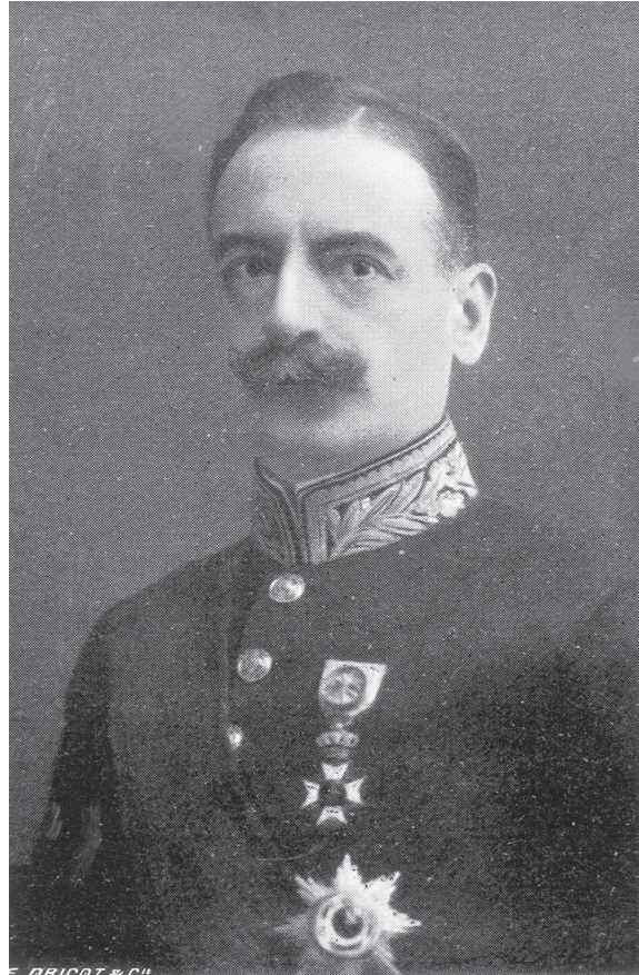
The Catholic Minister of War (1912-1917) and Prime Minister (1911-1918) Charles de Broqueville (1860-1940) implemented universal military service in 1913.