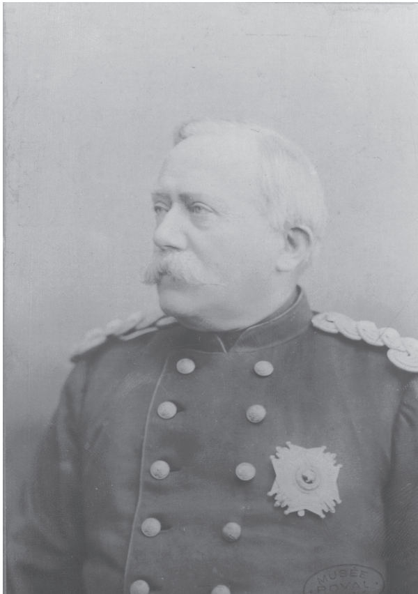
Lieutenant-General Henri Alexis Brialmont (1821-1903). Military engineer, publicist, Liberal Member of Parliament (1892-1894) and central figure within the militaristic lobby.