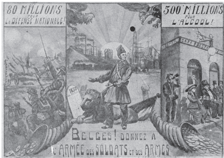
"Belgians! Give the army soldiers and weapons!", Propaganda postcard (1913) distributed by la Ligue de la Défense Nationale, which was founded in 1908 by politicians from the Liberal Party and (former) officers to promote army investments. (Collection Royal Museum of the Armed Forces and of Military History)