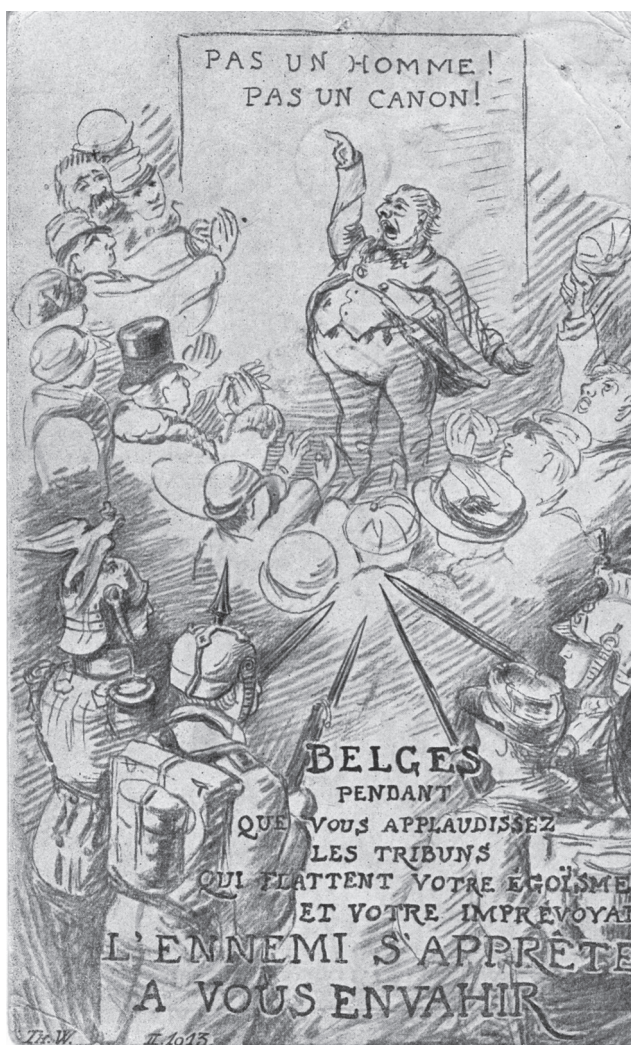
"Belgians! While you applaud demagogues that flatter your selfishness and improvidence, the enemy is on the verge of invading you", Propaganda postcard (1913) distributed by "La Ligue de la Défense Nationale". (Collection Royal Museum of the Armed Forces and of Military History)