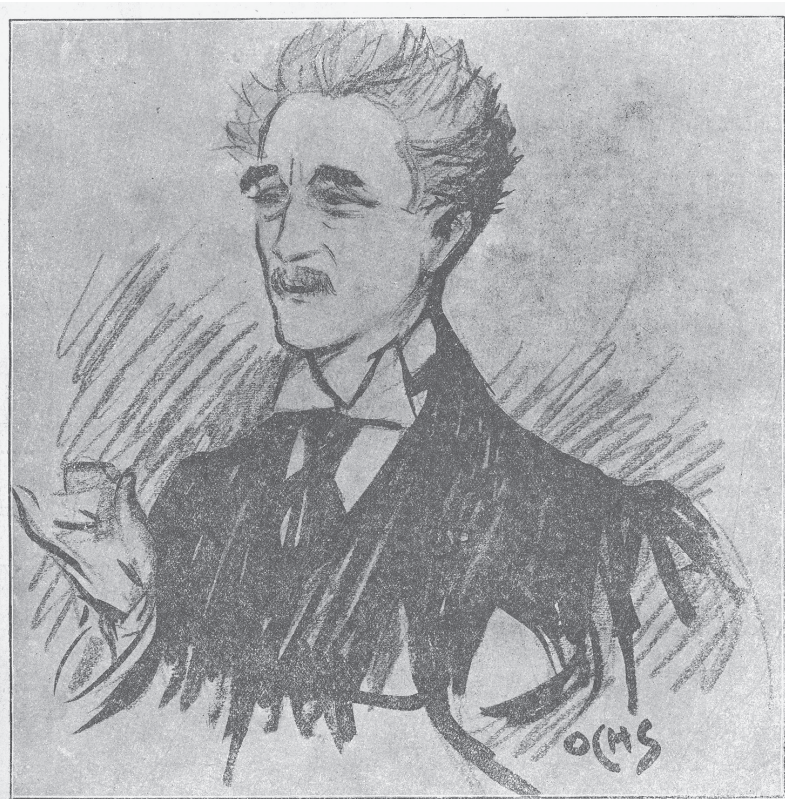
Paul Hymans (1865-1941), Liberal Member of Parliament (1900-1941) and advocate for universal military service and army investments.