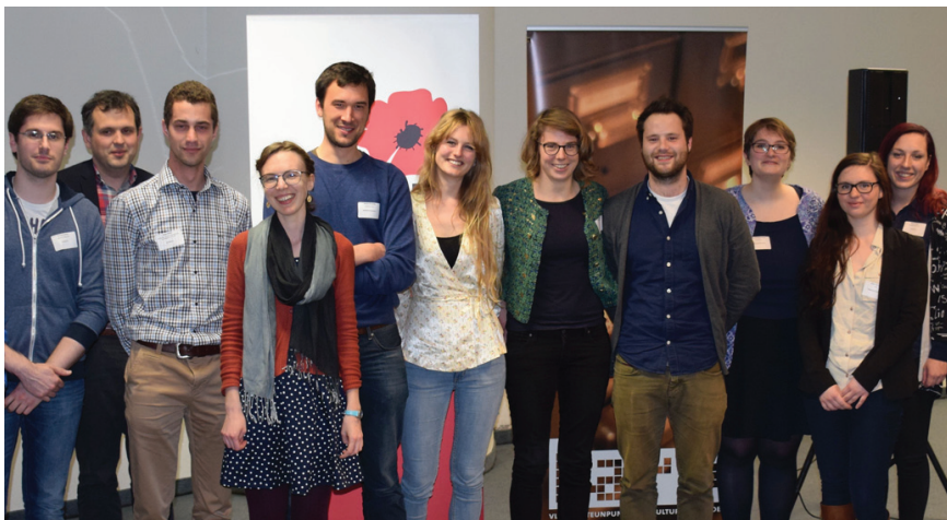
Some of the Belgian World War One PhD students after they presented their research posters during a 2016 seminar that brought together scholars, teachers, heritage workers and local historians working on the First World War.